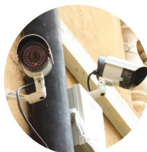
Video Surveillance Backhaul