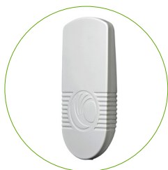
ePMP 1000 Integrated Radio