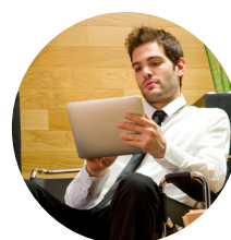
Remote Office Connectivity