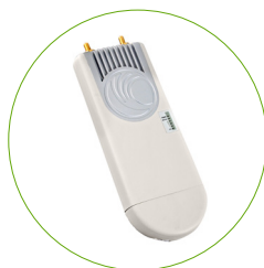
ePMP 1000 GPS Sync Radio