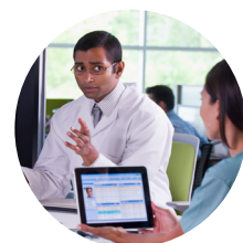
Primary or Redundant Connectivity